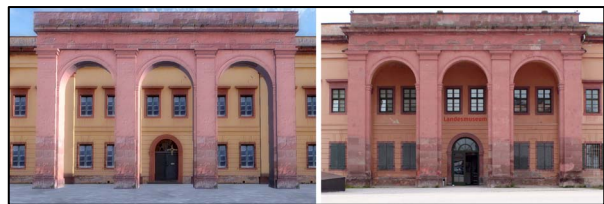
Figure 1: Authentic virtual simulation of the fortress (left: virtual model; right: real-life building)

We decided about these contents mutually with the Head Office for cultural heritage of Rheinland-Pfalz. Simultaneously, we needed to compile an elegant concept to embed this knowledge in the video game. The next section describes our reflections on video game structure and the semiotics (i.e. the study of signs and symbols) this concept was based on.