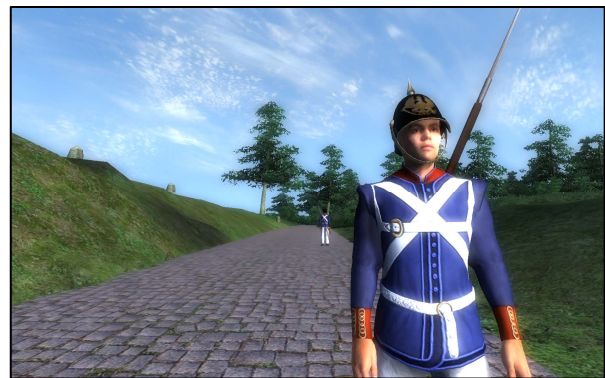
Figure 3: A virtual Prussian soldier guarding the outer area of the fortress

The purpose of this section was to offer a glimpse of the Eduventure’s game structure and knowledge encoding. The next section deals with some of our findings on test player reactions and describes what we learned from the making of the prototype.