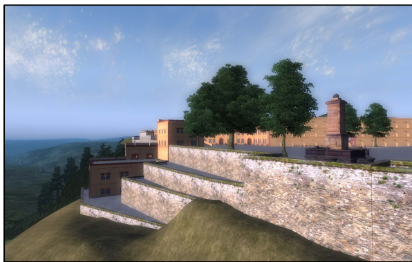
Figure 4: Oblivions rendering engine produces great visual results

These aspects will be an issue in one of our team's research oncoming project, which explores the relationship between motivation and knowledge acquisition on the basis of cognitive framing processes.